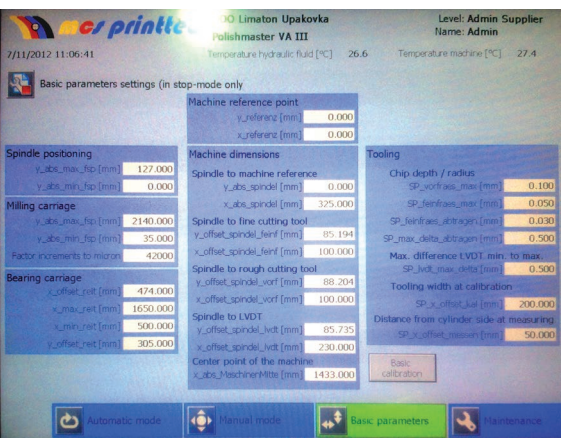
Retrofitted control system in operation

Control system retrofit realised in perfection.